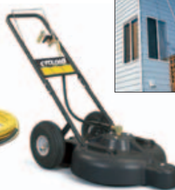
Rotary surface cleaner attaches to your pressure washer; reduces overspray and zebra striping

Smart phone users scan this code to go the Hotsy website