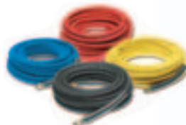
Heavy-duty, high-pressure hoses in lengths up to 150-ft.