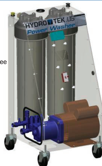
CWD Spot Free model shown