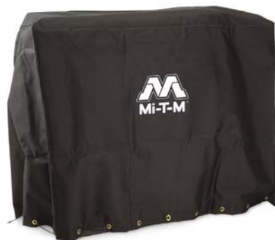
AW-6000-1006 Hot water skid equipment cover