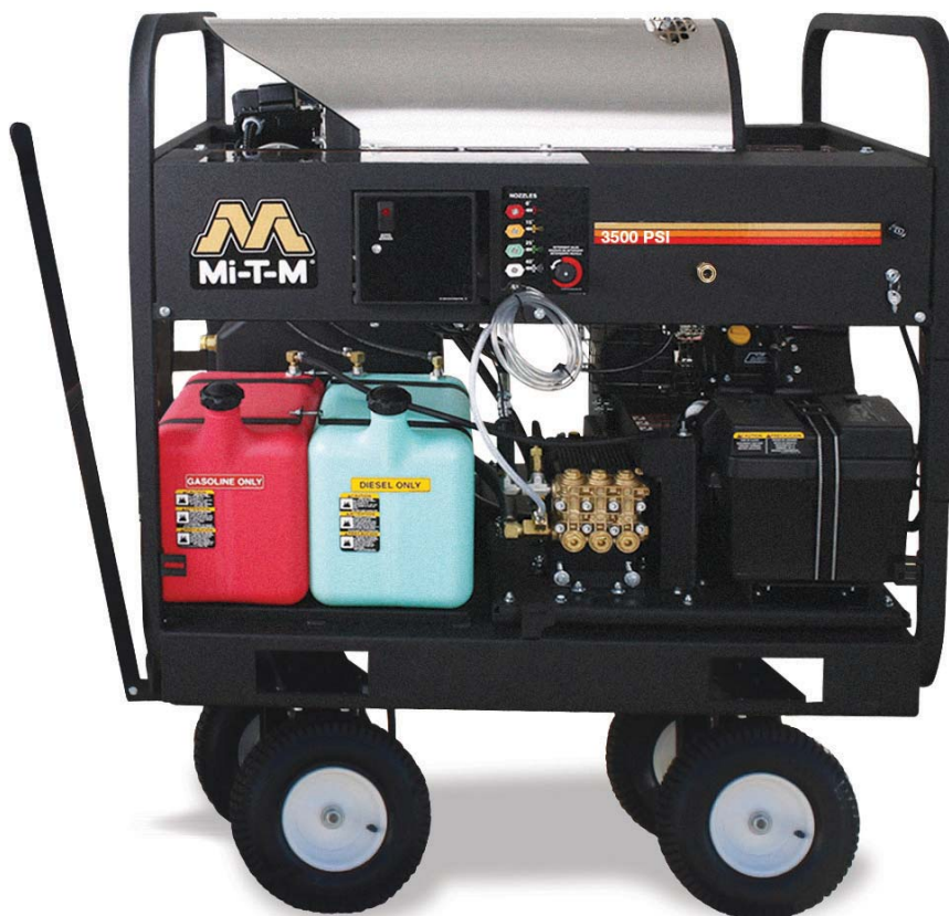
HDC-3505-0K6G shown with optional wheel kit

Large polyethylene float tank prevents rusting