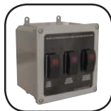
Optional Remote box