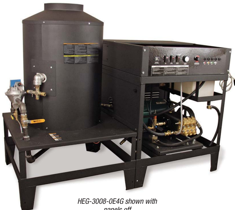
HEG-3008-0E4G shown with panels off

12-inch draft diverter included (24-inch height)