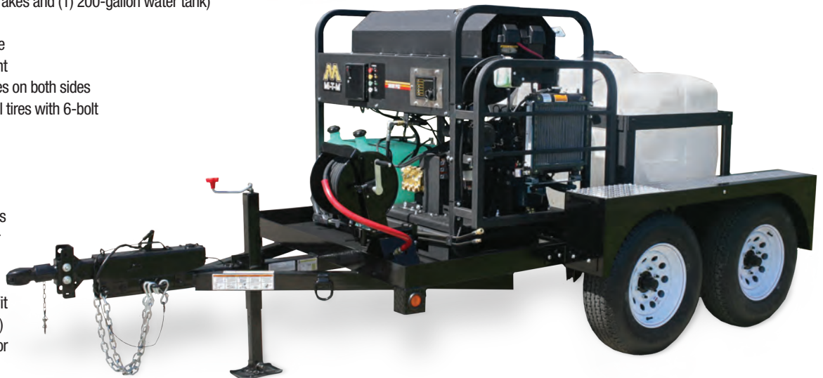
AW-9000-0008 shown with HS-3006-0MDK hot water pressure washer and hose reel (available as accessories)