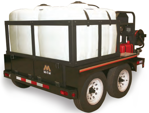
Storage area located under the water tanks